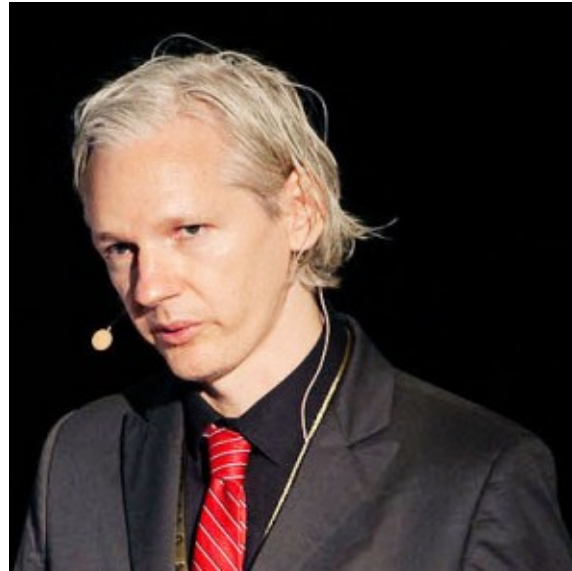
WikiLeaks founder Julian Assange at a media conference in Copenhagen, Denmark.

“Hackers may be anywhere,” he said. “There may be hackers, by the way, in the United States who very craftily and professionally passed the buck to Russia. Can’t you imagine such a scenario? ... I can.”