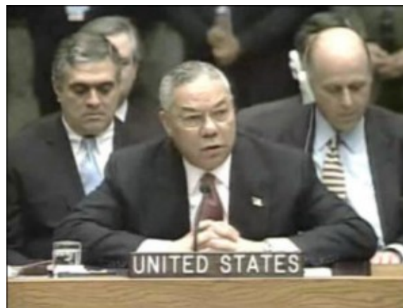
Secretary of State Colin Powell addressed the United Nations on Feb. 5, 2003, citing satellite photos which supposedly proved that Iraq had WMD, but the evidence proved bogus.

“The Russians” were the ideal culprit. And, after WikiLeaks editor Julian Assange announced on June 12, 2016, “We have emails related to Hillary Clinton which are pending publication,” her campaign had more than a month before the convention to insert its own “forensic facts” and prime the media pump to put the blame on “Russian meddling.” Mrs. Clinton’s PR chief Jennifer Palmieri has explained how she used golf carts to make the rounds at the convention. She wrote that her “mission was to get the press to focus on something even we found difficult to process: the prospect that