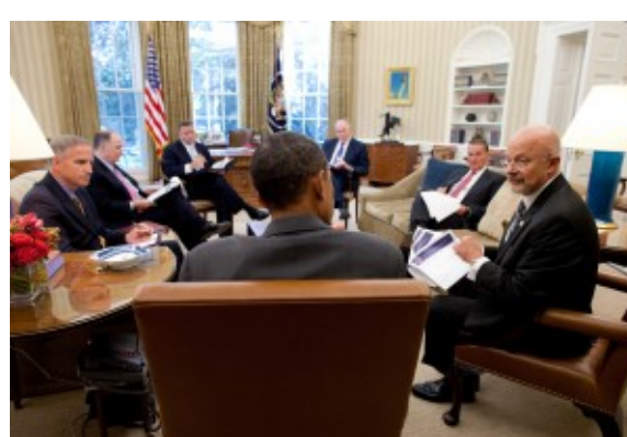
Director of National Intelligence James Clapper (right) talks with President Barack Obama in the Oval Office, with John Brennan and other national security aides present.

NOTE: There has been so much conflation of charges about hacking that we wish to make very clear the primary focus of this Memorandum. We focus specifically on the July 5, 2016 alleged Guccifer 2.0 “hack” of the DNC server. In earlier VIPS memoranda we addressed the lack of any evidence connecting the Guccifer 2.0 alleged hacks and WikiLeaks, and we asked President Obama specifically to disclose any evidence that WikiLeaks received DNC data from the Russians [see here and here ].